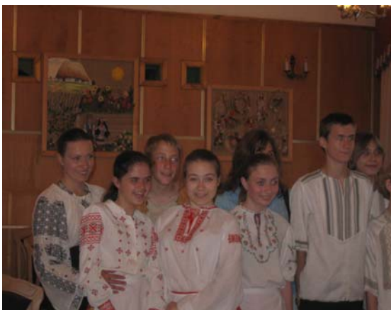
Children from the Kiev School for the Blind in Ukrainian costume

I started the Friends’ orphanage work in 2006 with one orphanage in Kiev and now operate in four situated all over the country from Kiev the capital to Slavutich in the north, Sumy in the east and Volodimir Volynsk in the west. This wide geographical spread accords with the Friends’ approach of cooperating with the whole country and not just the capital Kiev. It is highly desirable but it does make contact with all the homes more complex because of the distances involved. In the homes/schools there are in total about 250-300 children. They range in age from ten months to 17 years old. Many of the children are suffering from some kind of disability from impaired vision to Downs syndrome to the effects of Chernobyl (which by the way is a Ukrainian town just to the north of Kiev). In each case I have a local helper who maintains regular contact with the homes and makes sure that our money is being well spent.