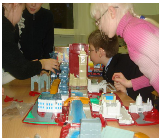
Children in the Blind School playing with the London lego set