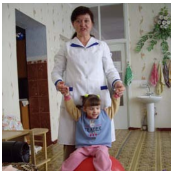
Bouncing balls are even better

I intend in future to keep you up to date with what is happening in the orphanages through a newsletter to be issued once or twice a year. See page overleaf for some recent highlights.