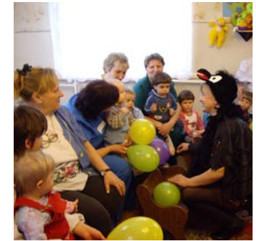
Balloons are great