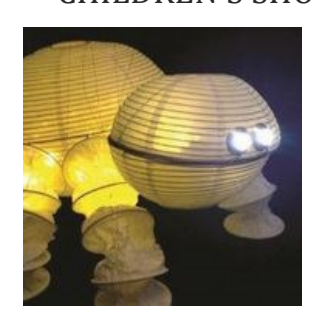
5, 6 August : <u>Light Puppet Show</u> Nikolai Zykov Theatre 11.05am, C venues – C (Venue 34)