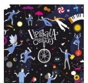
2-13, 15-20, 22-28 August: The Ping-Pong Ball Effect