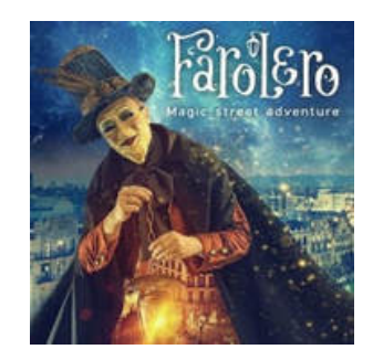
17-23 August: Farolero. Magic Street Adventure A walking city tour with the elements of sightseeing, theatre performance and quest performed in in English, Spanish & Russian. Suitable for all ages 9pm, Car park at the Scottish National Gallery on the Mound.