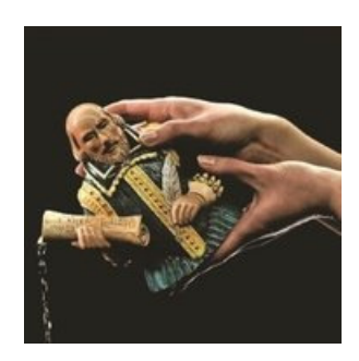
14-15 August: Re: A Midsummer Night's Dream Shakespearia Land (Russia) 11.30am C venues – C primo (Venue 41)